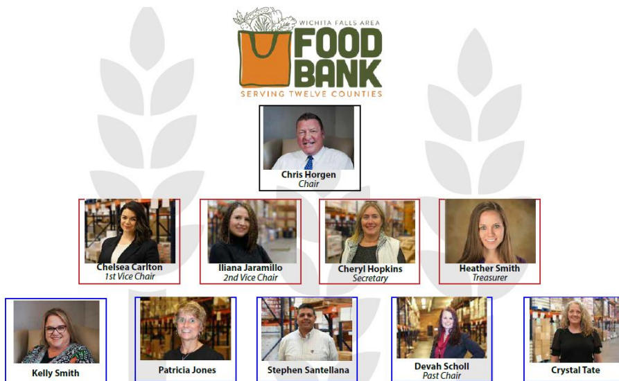
Board of Directors Organizational Chart 2024